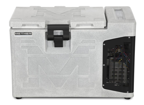
Can be used as refrigerator or freezer